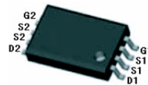
TSSOP-8 top view